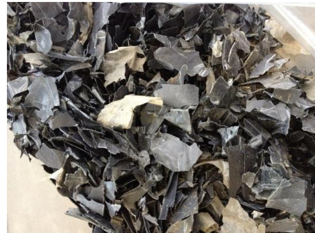
Figure: Flaked trial tray material for washing and decontamination analysis

2kg of detectable CPET tray material consisting of 1kg post-consumer and 1kg virgin tray material was ground to 15-20 mm flakes for washing and then decontamination analysis. Results were kept separately for the differently sourced materials.