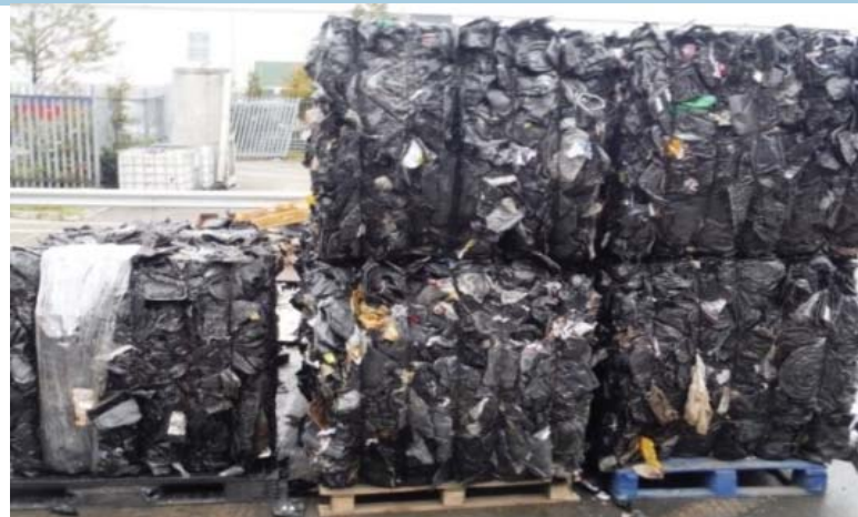
Figure: Mixed stream containing trial CPET trays after sorting at the MRF (on right, the 8 bales)

The issue of carryover material affecting the detection of the trial trays was not foreseen and was problematic for a manual separation of the trays. Taking normal business conditions into consideration for future work to separate detectable black CPET, it might be more realistic to plan for a less efficient separation of plastics at a MRF before onward plastics sorting at a PRF.