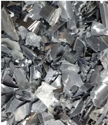
Figure: Post consumer CPET flake after washing and decontamination