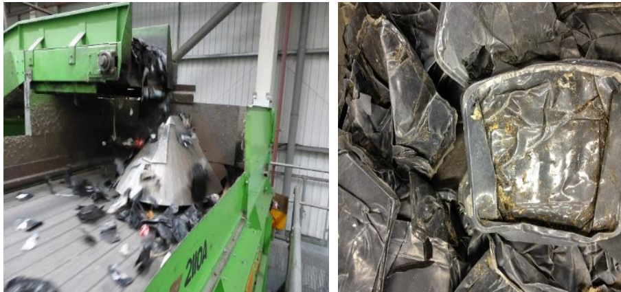
Figure: Automatic sorting for trial CPET trays at the PRF (on right, the recovered trays)

At the PRF, the bales of mixed plastics were sorted and approximately 100kg of detectable CPET material was recovered.